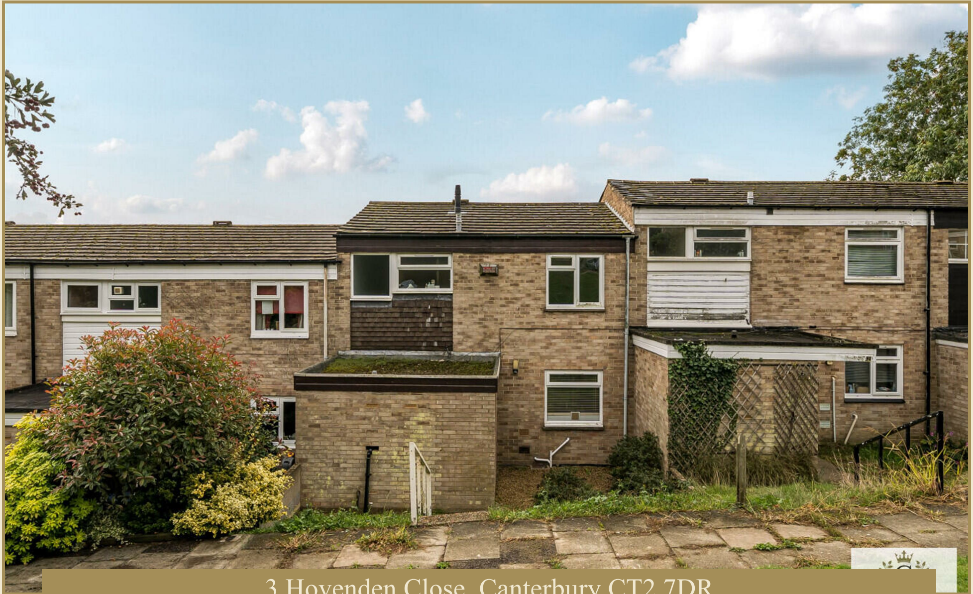
3 Hovenden Close, Canterbury CT2 7DR